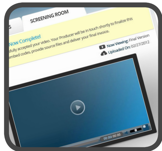
Private screening room for reviewing your video

Within 14 days of the shoot date, we will notify you that your video is ready for review. Your private screening room will allow you to review and provide feedback on your video. Once you approve the video and complete any final payments, you can download it right away.